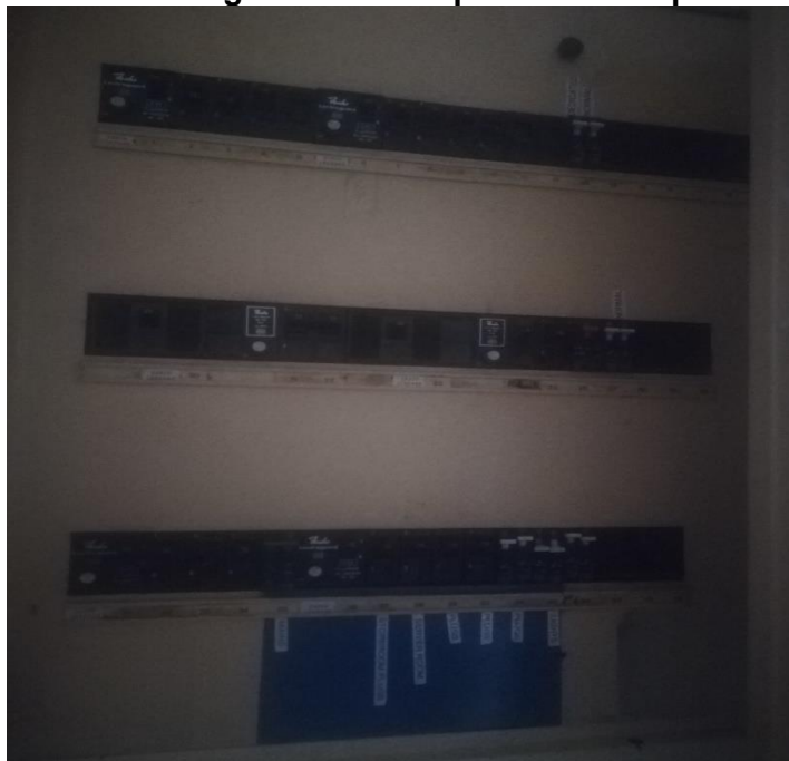
Figure 1.1 – Existing DB board as per table 1.1 specification

Board chairperson: Mr David Themba Ndhlovu